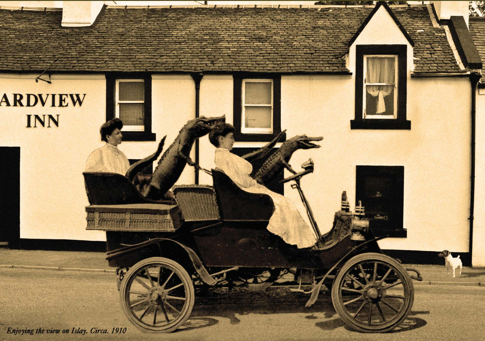
Enjoying the view on Islay. Circa. 1910