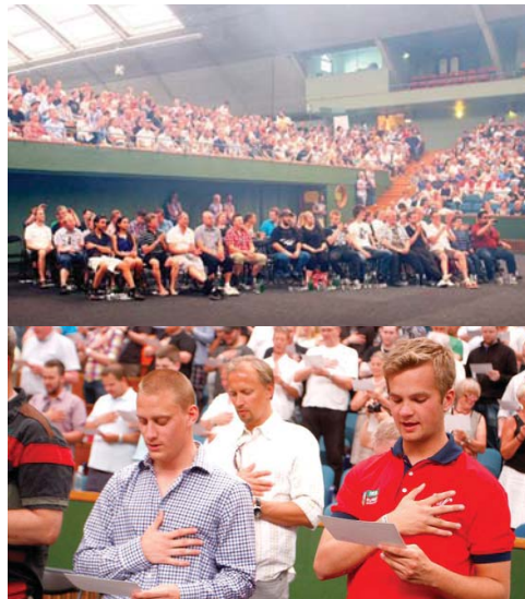
Stockholm's largest tennis club is used to seeing things getting smashed. Sadly on this occasion it wasn't a Guinness world record.

planet. (It's a dirty job, but someone's got to do it.) And while we narrowly missed out on a Guinness World Record for the biggest whisky tasting ever, with so many tastebuds being whetted, spirits weren't dampened. We might just have to do it all again sometime soon.