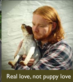
Real love, not puppy love