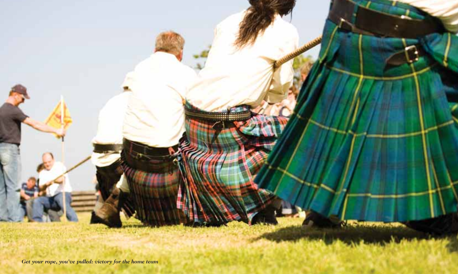
Get your rope, you've pulled: victory for the home team