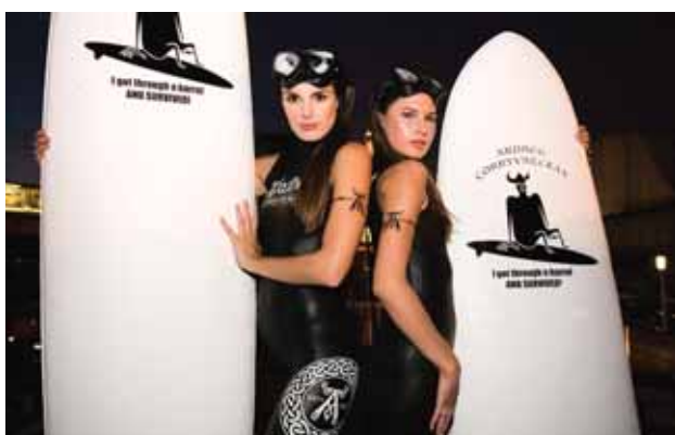
Corryvreckan, in a league of its own