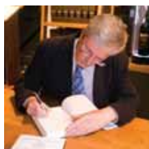
The author reigns supreme at a book signing in November

With The Lord of the Isles seemingly consigned to the history books, we are happy to recommend the only publication worth reading on the subject: David Caldwell's excellent Islay: The Land of the Lordship , which traces life on the island from the first residents to the present day. Unlike the whisky, this fascinating chronicle is available from our online shop.