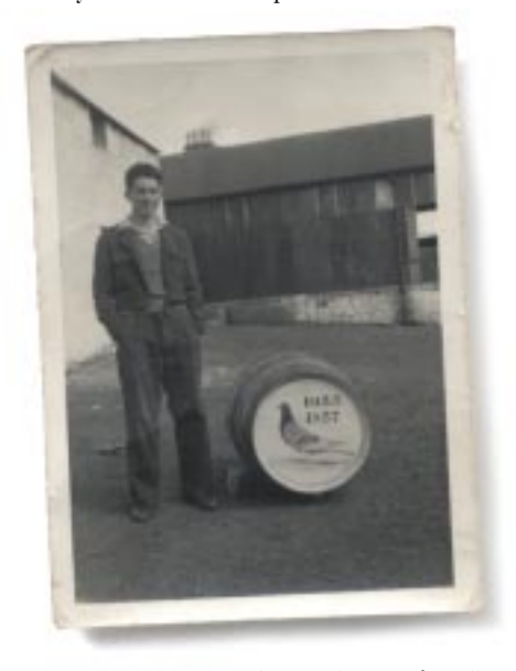
The Birdman of Ardbeg