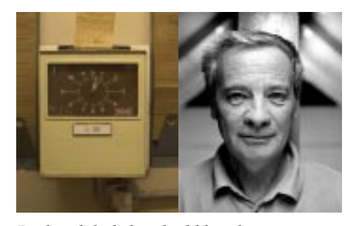
Big hand, little hand, old hand