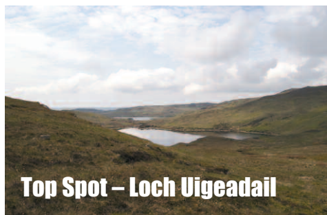
Top Spot – Loch Uigeadail

This record is by no means exhaustive (though it sounds exhausting) so if you have any further suggestions please, continue to send them in and we will gladly consider them for the list.