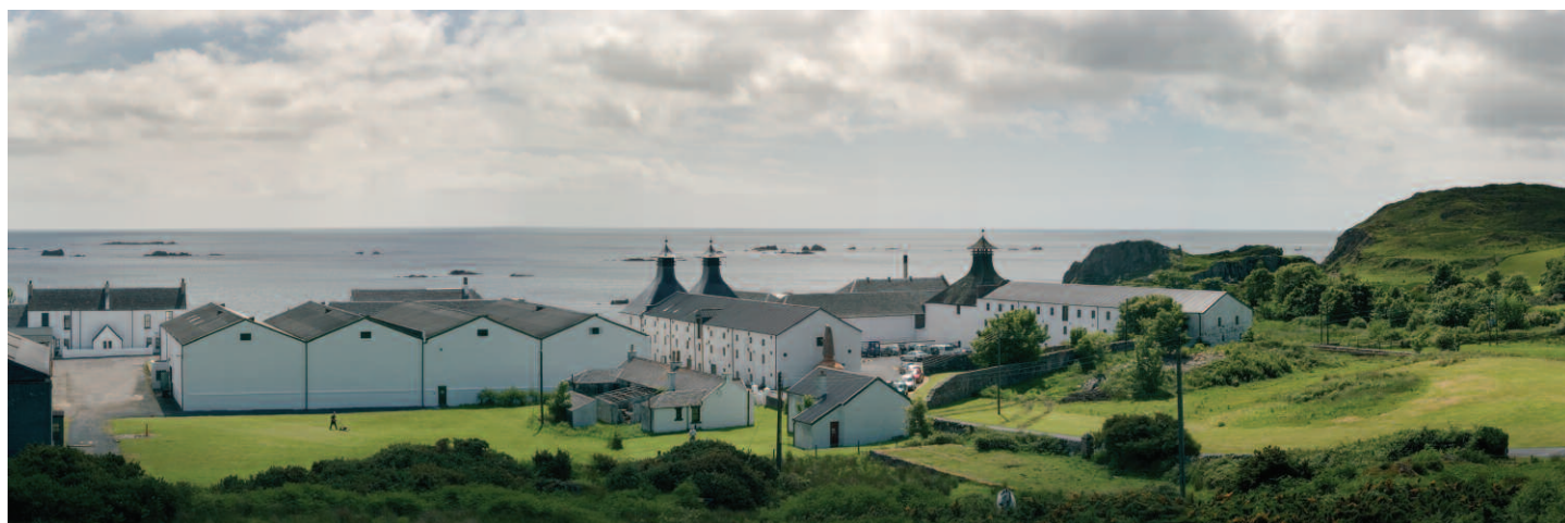
Ardbeg Distillery, Port Ellen, Islay, Argyll PA42 7EA, Scotland